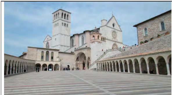
Fig. 1- Basilica of San Francesco in Assisi.

The Basilica of San Francesco in Assisi, Italy is one of the most famous Basilicas in the world and in 1997 it was struck by a sequence of earthquakes. Two of the vaults of the Basilica of San Francesco in Assisi collapsed as a result of the earthquakes with 5.6 and 5.8 magnitudes. The construction of the building began only two years after St. Francis of Assisi's death in 1226 and was completed in 1253. The structure had endured stronger earthquakes for centuries before these